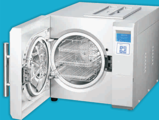
Table Top Sterilizer (Front Loading)